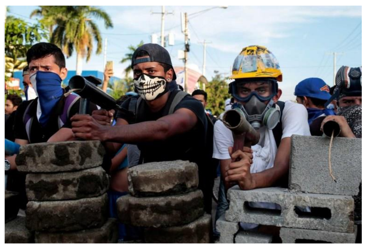
Bad faith UN report on Nicaragua whitewashes violent US-backed coup